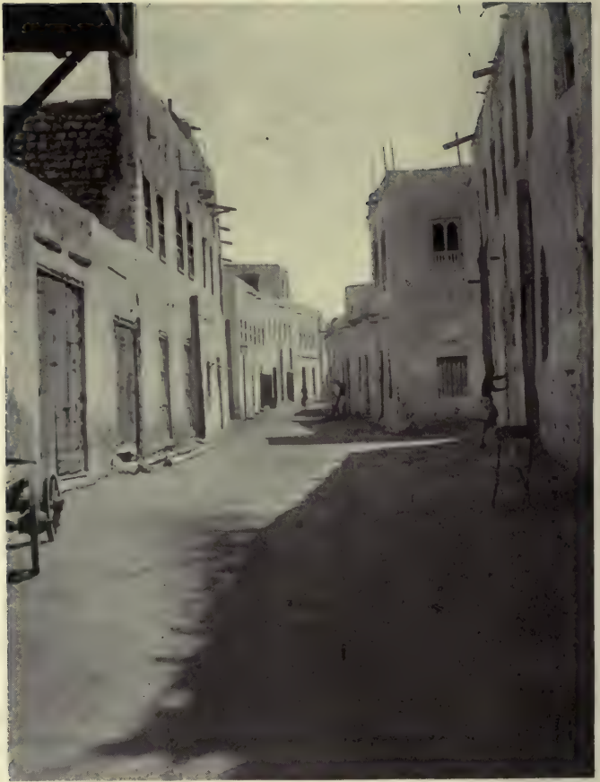
A STREET IN ZEILA.